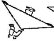
4. Place the first 2 fingers of right hand across corner, thumb below. Fold up and over fingers to the right.