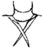
8. Cross long end over short at the "V"