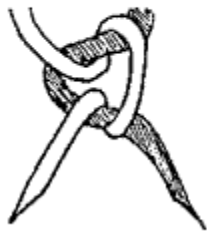
11. Bring long end back and thru the formed loop.