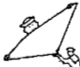
5. Repeat Step 3