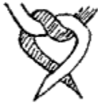
10. Cross long end over short