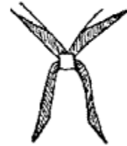
12. Shape knot as shown. Top of knot even with bottom of "V". Ends same length.